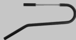
SNAKE-7 €80,00 Firm stainless steel side mount. Mounting Position L/R