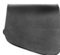
FOX-S DX €220,00 29x34x17 cm 15 lt. Mounting Position L / R Bag Clasp CS1 Max. Load Capacity 4 kg.