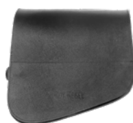
FOX-S SX €220,00 29x34x17 cm 15 lt. Mounting Position L / R Bag Clasp CS1 Max. Load Capacity 4 kg.