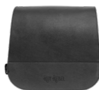
PEACOCK-S €235,00 32x34x16 cm 18 lt. Mounting Position L / R Bag Clasp CS1 Max. Load Capacity 4 kg.