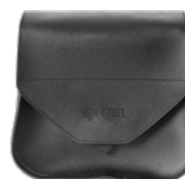
GOOSE €185,00 32x34x15 cm 16 lt. Mounting Position L / R Bag Clasp CS4 Max. Load Capacity 4 kg.