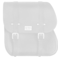
HORSE SX €310,00 40x40x20 cm 32 lt. Mounting Position L Bag Clasp CS1 Max. Load Capacity 5 kg.