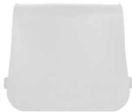
BULL-S €320,00 40x46x14 cm 26 lt. Mounting Position L / R Bag Clasp CS1 Max. Load Capacity 5 kg.