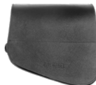
FOX-S DX €220,00 29x34x17 cm 15 lt. Mounting Position L Bag Clasp CS1 Max. Load Capacity 4 kg.