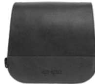
PEACOCK-S €235,00 32x34x16 cm 18 lt. Mounting Position L Bag Clasp CS1 Max. Load Capacity 4 kg.