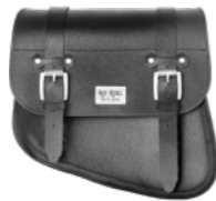
FOX DX €220,00 29x34x16 cm 15 lt. Mounting Position L / R Bag Clasp CS1 Max. Load Capacity 4 kg.