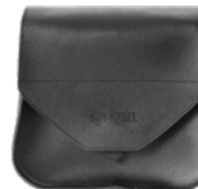
GOOSE €185,00 32x34x15 cm 16 lt. Mounting Position L Bag Clasp CS4 Max. Load Capacity 4 kg.