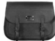
TELL €195,00 24x32x13 cm 10 lt. Mounting Position L Bag Clasp CS2 Max. Load Capacity 4 kg.