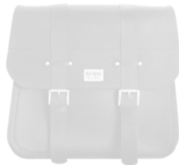
BULL €320,00 40x46x19 cm 35 lt. Mounting Position L / R Bag Clasp CS1 Max. Load Capacity 5 kg.