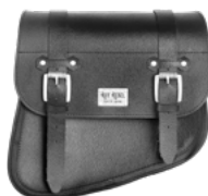
FOX SX €220,00 29x34x16 cm 15 lt. Mounting Position L / R Bag Clasp CS1 Max. Load Capacity 4 kg.