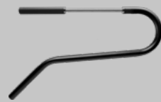
SNAKE-5 €80,00 Firm stainless steel side mount. Mounting Position L/R