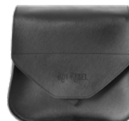
GOOSE €185,00 32x34x15 cm 16 lt. Mounting Position L / R Bag Clasp CS4 Max. Load Capacity 4 kg.