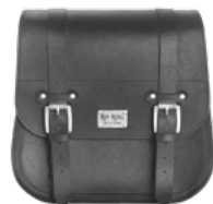
PEACOCK €235,00 32x34x16 cm 18 lt. Mounting Position L / R Bag Clasp CS1 Max. Load Capacity 4 kg.