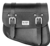
FOX DX €220,00 29x34x16 cm 15 lt. Mounting Position L / R Bag Clasp CS1 Max. Load Capacity 4 kg.