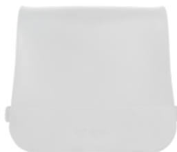
BULL-S €320,00 40x46x14 cm 26 lt. Mounting Position L / R Bag Clasp CS1 Max. Load Capacity 5 kg.