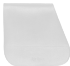
HORSE-R SX €335,00 40x40x18 cm 25 lt. Mounting Position L Bag Clasp CS3 Max. Load Capacity 5 kg.