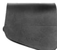
FOX-S DX €220,00 29x34x17 cm 15 lt. Mounting Position L / R Bag Clasp CS1 Max. Load Capacity 4 kg.