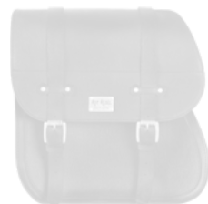
HORSE SX €310,00 40x40x20 cm 32 lt. Mounting Position L Bag Clasp CS1 Max. Load Capacity 5 kg.