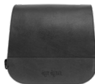
PEACOCK-S €235,00 32x34x16 cm 18 lt. Mounting Position L / R Bag Clasp CS1 Max. Load Capacity 4 kg.