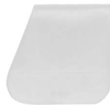
HORSE-R DX €335,00 40x40x18 cm 25 lt. Mounting Position R Bag Clasp CS3 Max. Load Capacity 5 kg.