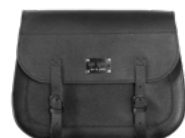
TELL €195,00 24x32x13 cm 10 lt. Mounting Position L / R Bag Clasp CS2 Max. Load Capacity 4 kg.