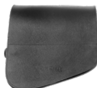
FOX-S SX €220,00 29x34x17 cm 15 lt. Mounting Position L / R Bag Clasp CS1 Max. Load Capacity 4 kg.