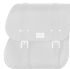
HORSE DX €310,00 40x40x20 cm 32 lt. Mounting Position R Bag Clasp CS1 Max. Load Capacity 5 kg.