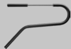
SNAKE-2 €80,00 Firm stainless steel side mount. Mounting Position L/R