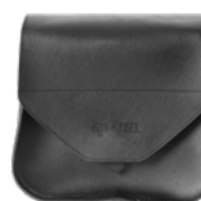
GOOSE €185,00 32x34x15 cm 16 lt. Mounting Position L / R Bag Clasp CS4 Max. Load Capacity 4 kg.