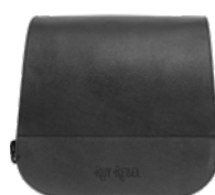
PEACOCK-S €235,00 32x34x16 cm 18 lt. Mounting Position L / R Bag Clasp CS1 Max. Load Capacity 4 kg.